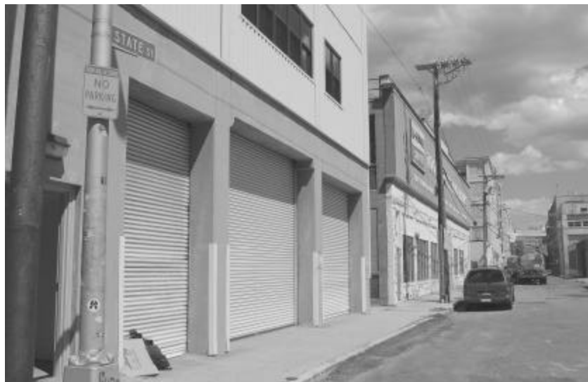
Looking east along Cambridge’s not-so-stately State Street (2006 photograph)

Then there’s that would-be seaport, Cambridgeport. It, too, has a State Street, but with none of the grand airs of its sisters. For one thing, you have to go looking for it. And for another, once you’ve found it, there’s not much there—and only the hint of its name to suggest it might have served a grand purpose.