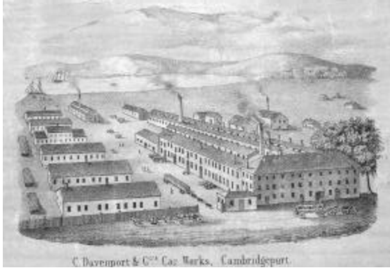
An illustration on the 1854 Walling map of Cambridge shows the Davenport & Co. Car Works. We are looking south from Main Street.

Hail's street listings suggest that development of any consequence did not begin until close to midcentury, with the building of residences that doubled as workshops for a variety of artisans—carpenters, brush makers, a bacon curer.