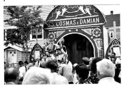
Festival of Sts. Cosmas and Damian, 2007

The relationship with Gaeta, Italy, is the oldest, dating from 1926. Each year, citizens of Gaeta come to Cambridge to celebrate the