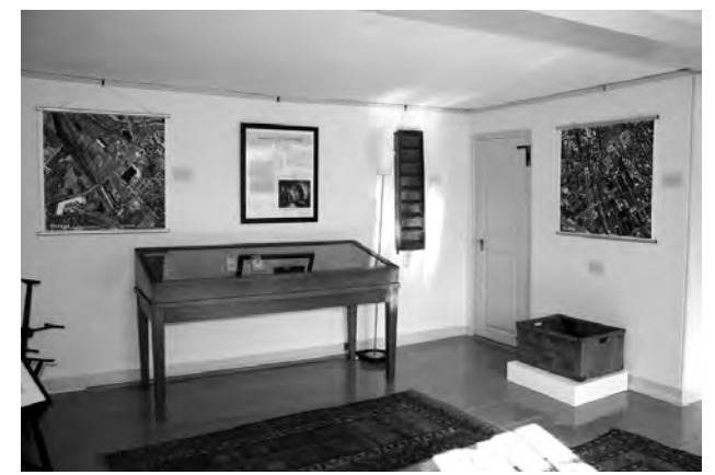
Display on industry in the East Chamber

Now, every display can be changed and new exhibits created to bring visitors back again and again.