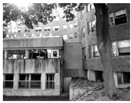
The Dining Hall of Baker House

Designed by Alvar Aalto and constructed in 1947-1949, the brick exterior is a clear reference to Scandinavian Modernism. Aalto placed deformed and burned bricks at intervals throughout the surface, giving an interesting texture and movement to the building's surface. The undulating façade gives each room a view up or down the Charles River, not just across it, and creates unique floor plans in each room. The dining hall is constructed with sharper angles and more industrial materials, contrasting sharply with those of the main dormitory. Along the roof of the hall, playful lights hang over