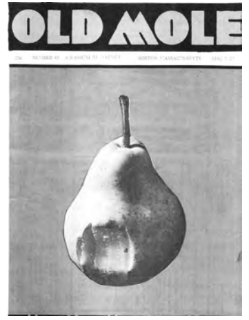
August 7-27, 1969

The only issue that had a second printing was the one in which we reprinted letters and memos liberated during the 1969 student strike that described Harvard's CIA links and its