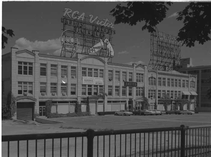
The RCA and Whirlpool signs along Memorial Drive

Along Cambridge Parkway there were, among others, the Carter's Ink sign with its clock and,