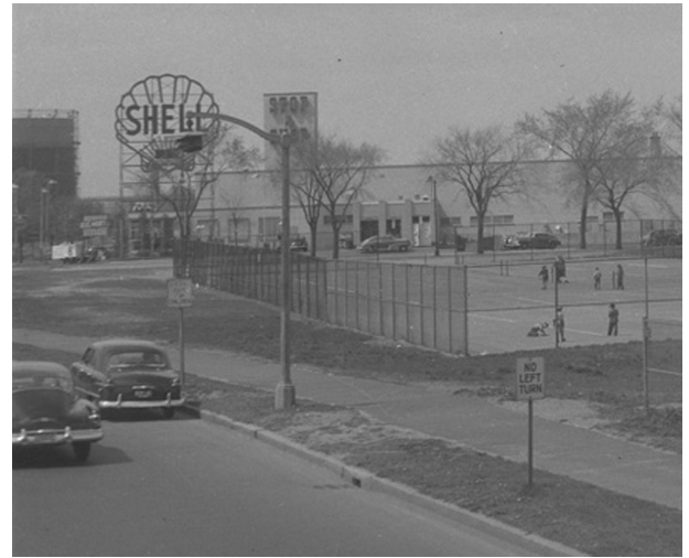
The Shell sign from Memorial Drive, looking northeast

topping a row of massive industrial buildings, signs announcing the presence of Gordon, the knitwear maker, General Electric, and Parke-Davis.