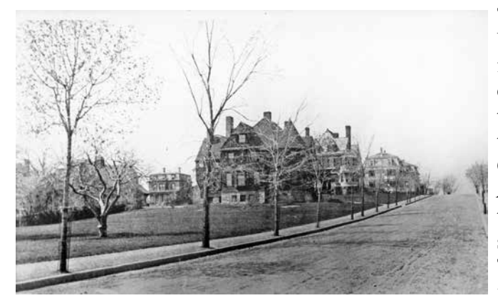
View up Washington Avenue, from The Cambridge of 1896 .

This issue of the The Cambridge Historian presents a snapshot of the Avon Hill neighborhood, with articles on an ancient landmark, a made-for-television restoration project, the workings of the Neighborhood Conservation District, a place of deadly ends, and neighborhood traditions.