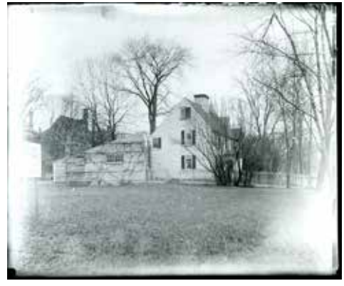
1901, by Lois Lilley Howe; L. L. Howe Collection bet you can't tell.

sheathing, a series of strapping strips were screwed on and the new shingles nailed to them. No new roofing nails will ever go into the old boards. It raised the roof surface appreciably in relation to the raking gable trim – but I bet you can't tell.