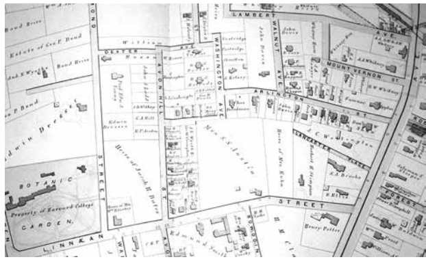
Plate F from the G. M. Hopkins Atlas of Cambridge, 1873

Porter Square is called Union Square on the 1894 map.