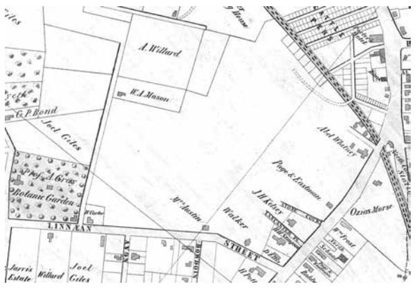
The Walling Map of Cambridge, 1854