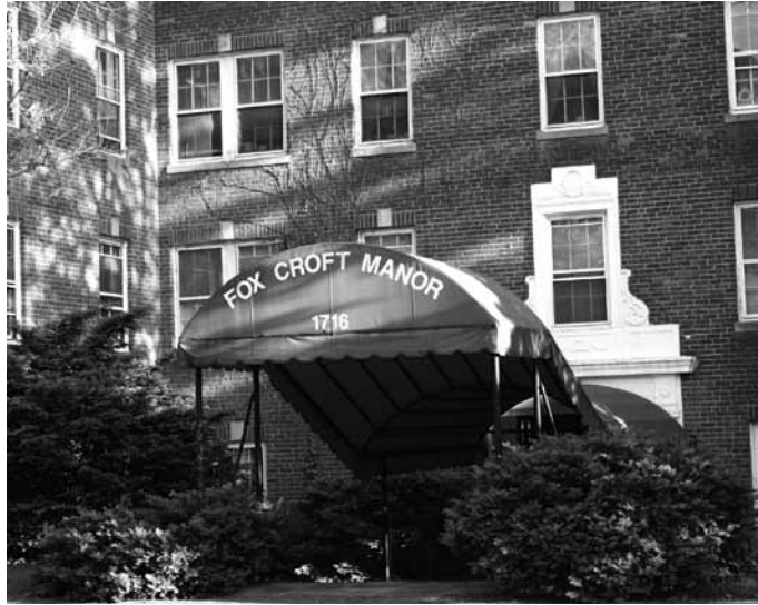
1716 Cambridge Street